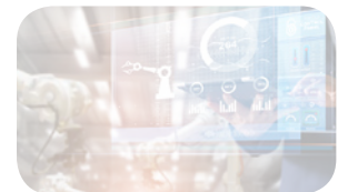
Industrial & Medical