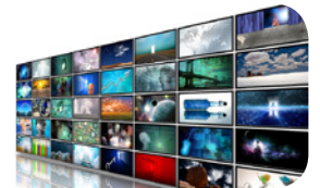
Flat Panel Display