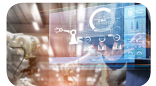
Industrial & Medical