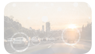
IoT/IoV & Optoelectronics